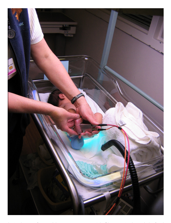
Fig. 3. Clinical use of portable RRS scanner with fiber optical module for heel skin carotenoid measurements in infants. From Ermakov et al. [71], copyright Wiley-VCH Verlag GmbH & Co. KGaA. Reproduced with permission.

Age does not appear to be an important determinant of skin carotenoid status in adults, although a wide age range has not been systematically evaluated. In babies and young children, however, those who are older on average have higher skin carotenoid status (see Biomarker Development: Feasibility below). In terms of gender, on average, women have higher skin carotenoid status than men [43,56], consistent with what is known about adipose tissue [70] and plasma carotenoids [59], likely reflecting greater intake of fruits and vegetables in women along with smaller body size.